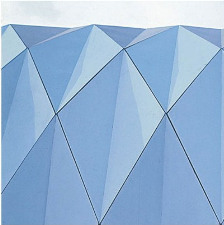
Renzo Piano 1967