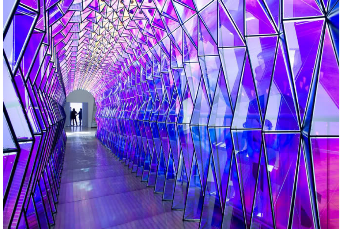
Olafur Eliasson 2007